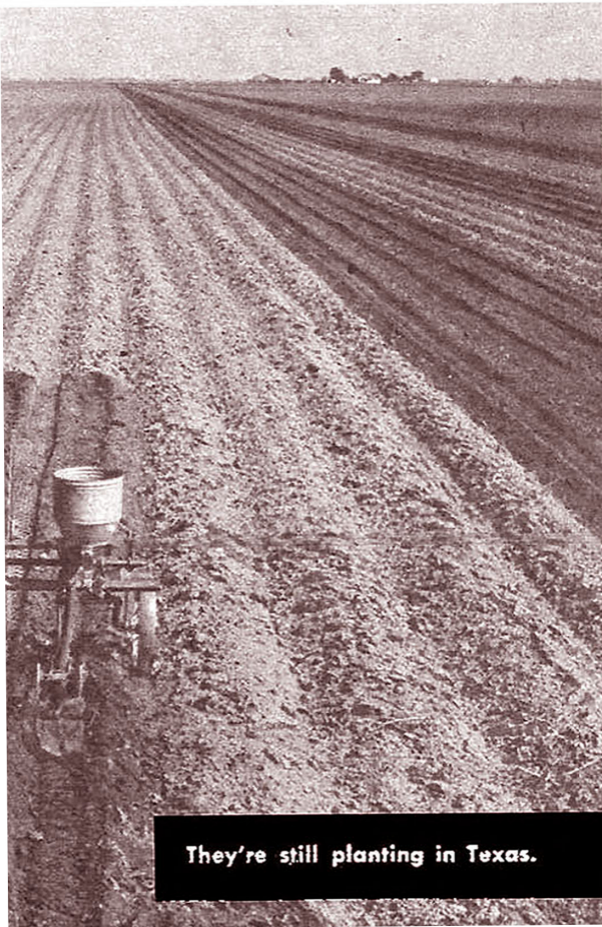
They're still planting in Texas.