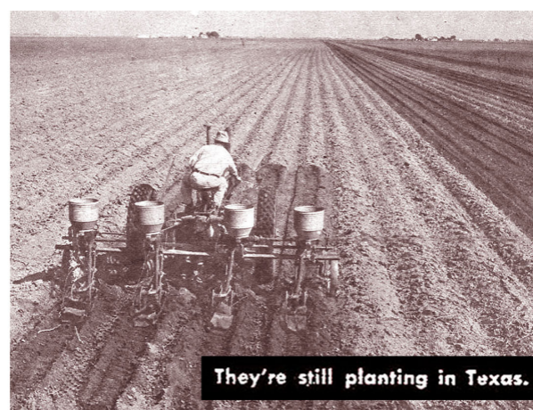
They're still planting in Texas.

Here the delicate question of our relations with the Soviet Union enters into the picture, and Joe cannot fail to notice the numerous indications that the unity of the United Nations has slipped a