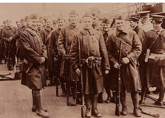
The 339th Infantry Regiment en route.

But the area was menaced by some armed Red steamboats operating from the lake, so before we reached the town the decision was made to neutralize these vessels. Accordingly, Jones threw a two-mile spur from the main line through the woods to the lake, and American motor patrol boats were carried in and launched.