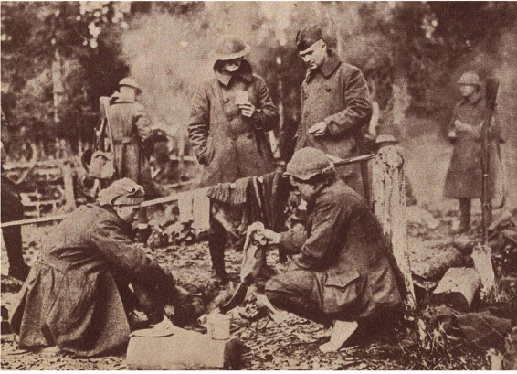
Even after snow cleared, conditions were tough. Here, U.S. soldiers dry clothes over fire after 17-mile advance through muddy swampland.

Pitted against an enemy as brutal and devious then as he is now, they were confronted by equally brutal climatic conditions—long, bitter hours of arctic darkness; clinging, waist-deep snow; and temperatures which often dropped as low as 20 degrees below zero. They lived for day after dreary day on canned and dried rations in their lonely outposts. Untried troops with mostly green officers, they learned as they went along, griping and swearing, but completing their mission with the respect of Allies and enemies alike.