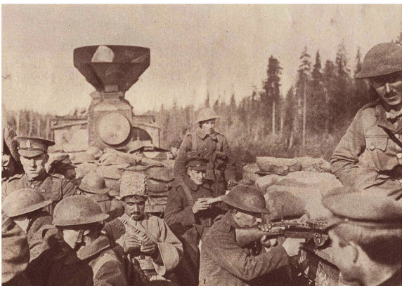
MacMorland's railroad troops, working constantly under fire had an armored train which included sandbagged flatcar. Note ancient engine in the background of the photograph.

small 11-nation contingent which had arrived there earlier. (Most of the men in this latter division were from Michigan; the 339th Regiment, which formed the backbone of the U.S. contribution to the Allied army in north Russia, was known as "Detroit's Own.")