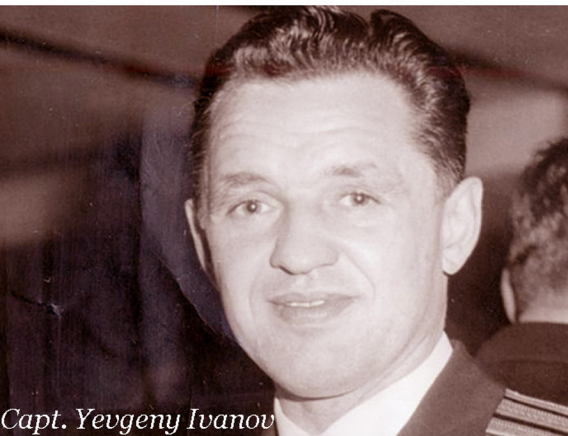
Capt. Yevgeny Ivanov

Capt. Yevgeny Ivanov, the Kremlin agent who shared Christine Keeler's affections with Britain's War Minister Profumo. Contrary to published reports, it was not the Profumo scandal that caused Ivanov's downfall—but his relationship with Penkovsky. The two were old friends and classmates for four years at Moscow's Military Diplomatic Academy, Russia's top espionage school.