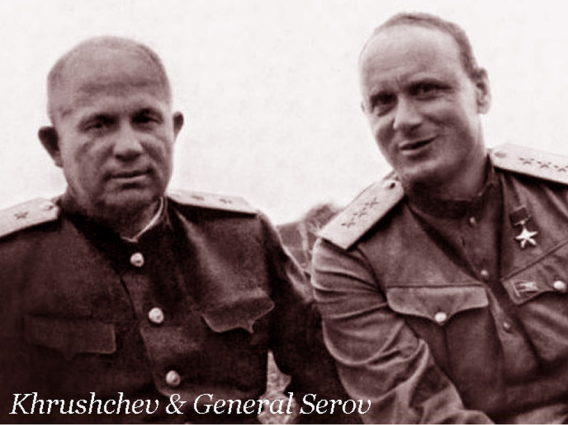
Khrushchev & General Serov

Serov, an old-time executioner in charge of many Kremlin blood baths, favored assassinating Khrushchev. But cooler heads prevailed.