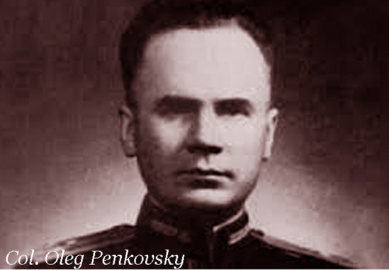
Col. Oleg Penkovsky

fought gallantly in both the Finnish campaign and World War II. He became a lieutenant-colonel at 26 and received a dozen decorations for valor, including the Order of the Red Star, two Orders of the Red Banner, the Order of the Patriotic War and the Order of Alexander Nevsky.