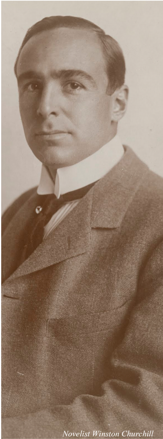
Novelist Winston Churchill

I simply can't believe, if the God of the universe is the moral God you assert him to be, that he has established on earth an agency of the kind you infer and delegated to it the power of life and death over human souls. . . . Can't you see that an authoritative statement is just what an ethical person doesn't want. Belief—faith—doesn't consist in the mere acceptance of a statement, but in something much higher—if we can achieve it. Acceptance of authority is not faith, it is mere credulity, it is to shirk the real issue. We must believe, if we believe at all, without authority.' She tells him that 'he and his religion are as far apart as the poles; in order to preach his doctrine logically, he should be a white ascetic, with a well-oiled manner, a downcast look lest he stumble in his pride or do something original that sprang out of his own soul instead of being an imitation of the saints.' Her provocative frankness and clear-eyed honesty goad him into introspective study of himself."