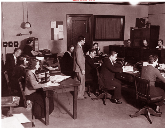
The Central Casting office that gives out "extra" work.

The percentage of women in the extra ranks is almost double that of men, but—and here's an unfortunate fact—there is work for but half as many women as men! And we don't need a diagram to explain that the position of a destitute girl in a strange town is far worse than that of a destitute young man. In the motion picture of today mere beauty is a very secondary requirement, and usually the winner of a home-town beauty contest had better stay home, as ninety-nine times out of a hundred she's just "five dollars' worth of pretty girl."