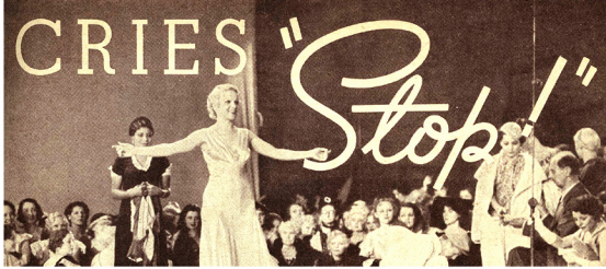
Above: "Extras" waiting to be checked in at a Hollywood studio. The man in white represents one day's work—the other twenty-six, the "extras" who are available for it. Above: "Dress people" showing, at the Central Casting Corporation's review, that they belong in their class.