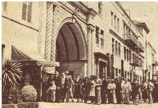
"Extras" waiting to be checked in at a Hollywood studio.

The constant cry is "Give us work!" It can't be done to satisfy the need. Until recently, perhaps because of misunderstanding of the problem, the destitute and