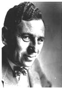
Ye Olde Rube

I PULLED up in front of a gas station that looked like Luna Park in Coney Island and before I could say what I wanted a sun-bronzed attendant, clad in immaculate white, thrust his head through the window and said, "God's country, isn't it!" I simply answered, "No," and drove off.