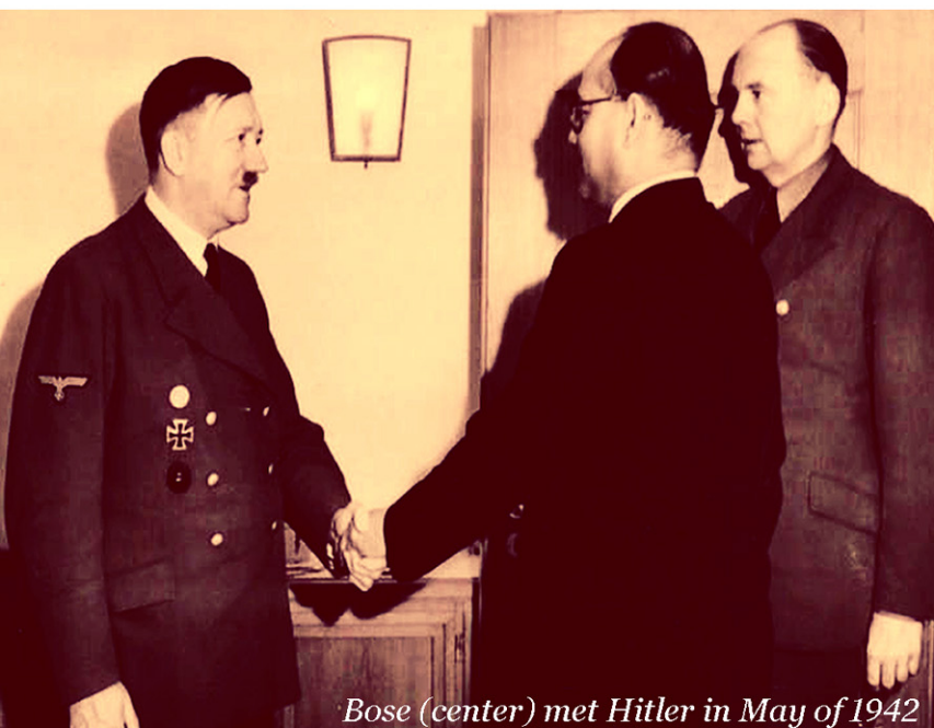
Bose (center) met Hitler in May of 1942

As if to flout the Mahatma's insistence on nonviolence, there were outright massacres in Bombay, Malabar and the village of Chauri-Chaura, where twenty-one policemen and watchmen were drenched in oil and burned alive.