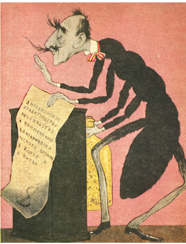
Spidery Secretary of State. Dean Acheson's placard explains that "The U.S. Government has no part in the application of bacteriological weapons in Korea and China."