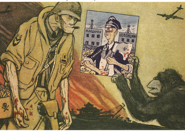
"Corrections to Darwin." The ape holds a picture of Gestapo chief Himmler and Nazi concentration camps. He tells the U.S. soldier: "No, it's not from me you descend, Mister, it's from him."

Line of Lies. Since then the Kremlin—echoed by Reds everywhere—has accused the U.S. of torture, rape and germ warfare. Americans, the Reds claim, have led war prisoners by rings through their noses. U.S. soldiers, they charge, stuffed a woman's hair into her mouth and pulled it out through a hole they had cut in her throat.