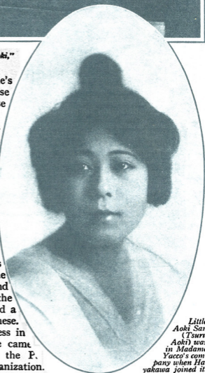
Little Aoki San (Tsuru Aoki) was in Madame Yacco's company when Hayakawa joined it.

The great actress and her company planned an international tour, a few years ago, and young Hayakawa and his wife accompanied them to this country. It was then Hayakawa planned to introduce the American and English drama into Japan, and he studied English drama and literature at the Chicago University for a year, and translated a number of the English classics into Japanese. Having returned to Japan and made a success in Ibsen and Shakespeare as related above, he came back to this country, and played all along the Pacific Coast at the head of the Japanese organization.