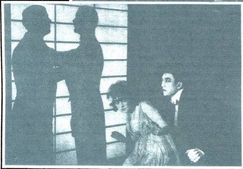
"Still" photographs from the Lasky photoplay.

characters, speaking in high falsetto when interpreting a feminine role."