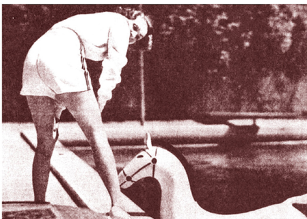
Marlene Dietrich keeps busy and forgets to sleep when pounds and ounces gather

Symmetry is the objective of Hollywood body sculptors. For bust-reduction, Loomis has a simple formula: Jump up and down with no support. Exercises in which the arms are forced backward and forward horizontally are used to develop the upper chest.