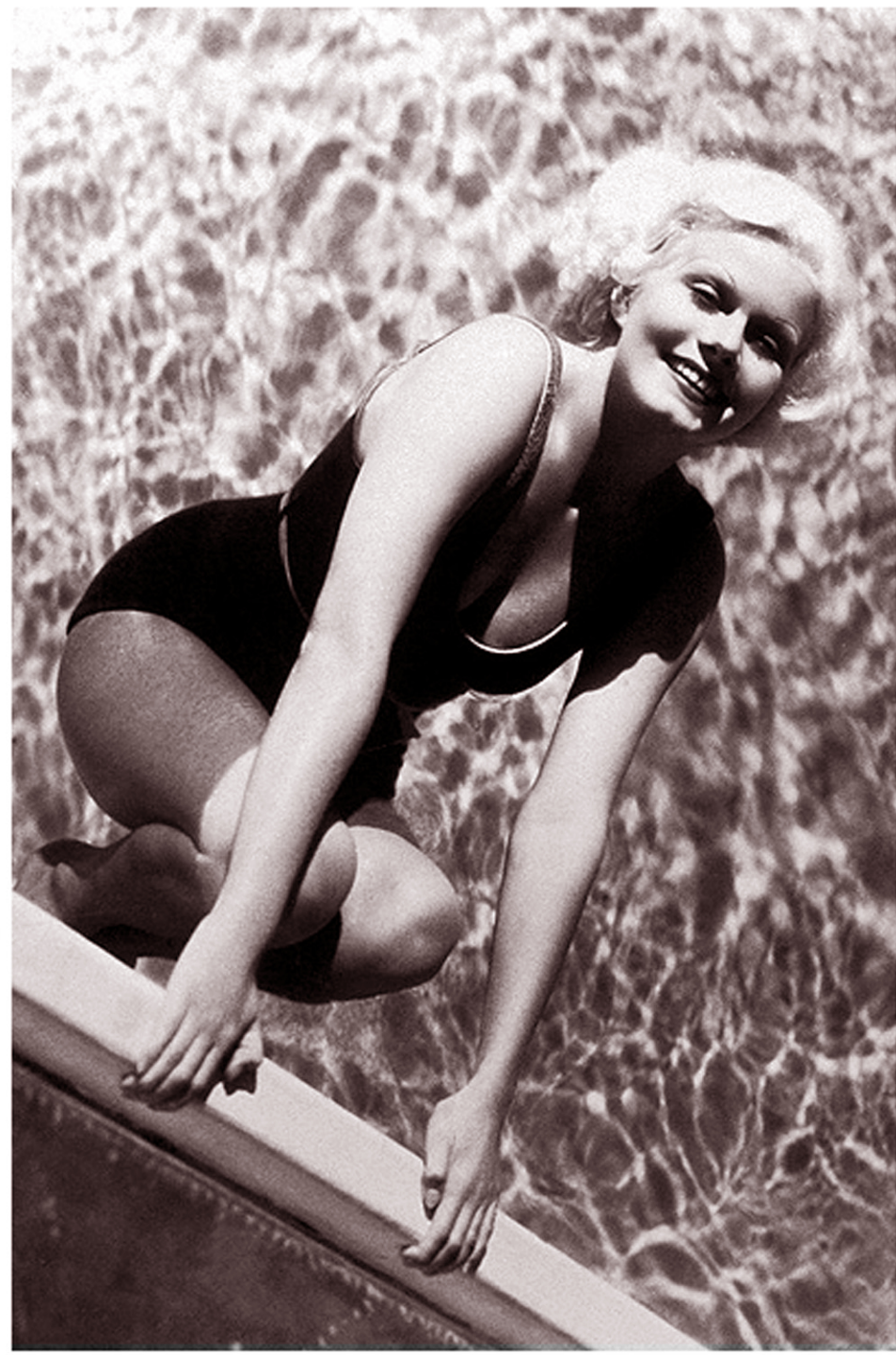
Miss Harlow keeps stream-lined by swimming

The girl with the piquant face, a movie star in the making, watched the studio physical director apprehensively. Her short gymnasium trunks and pull-over sweater revealed her figure as undeniably plumpish in spots.