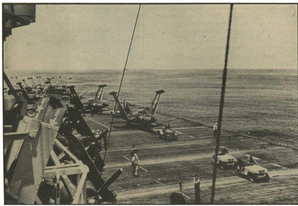
Big flattop. Secretary Johnson called aircraft dead dodoes.

This does not mean that the U.S. must match Russia man for man, gun for gun or tank for tank. But it does mean we cannot coast along on the false security of supposed superiority in atom bombs. The U.S. now needs, according to the JCS, an army of at least 2.6 million men, sufficiently elastic in command, weapons