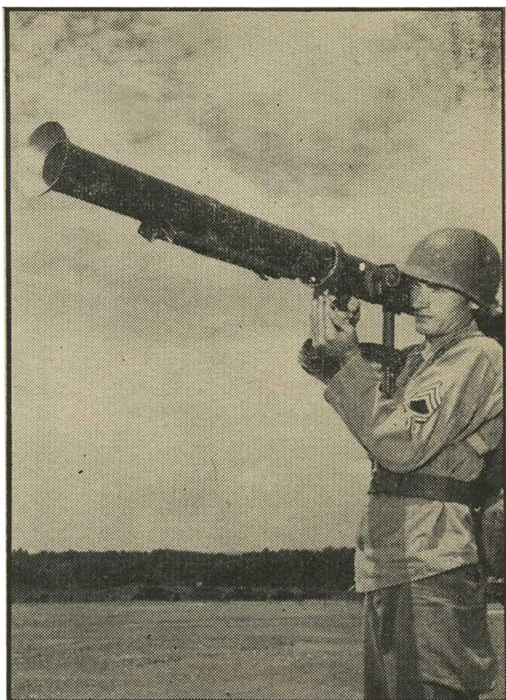
Tank-buster. A five-year-old weapon takes slow trip to Korea.