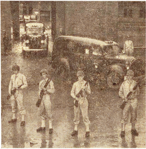
Six Nazi saboteurs, whose bodies are in these Army ambulances, learned that America was waking up quickly.

In 1934, ODWU units throughout the country were asked to register the names of all Ukrainians in this country with a knowledge of aviation, wireless and like talents. A reproduced affidavit lists important bridges, factories and highways photographed by these volunteers.