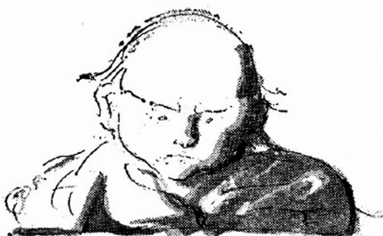
MARSH BY MARSH