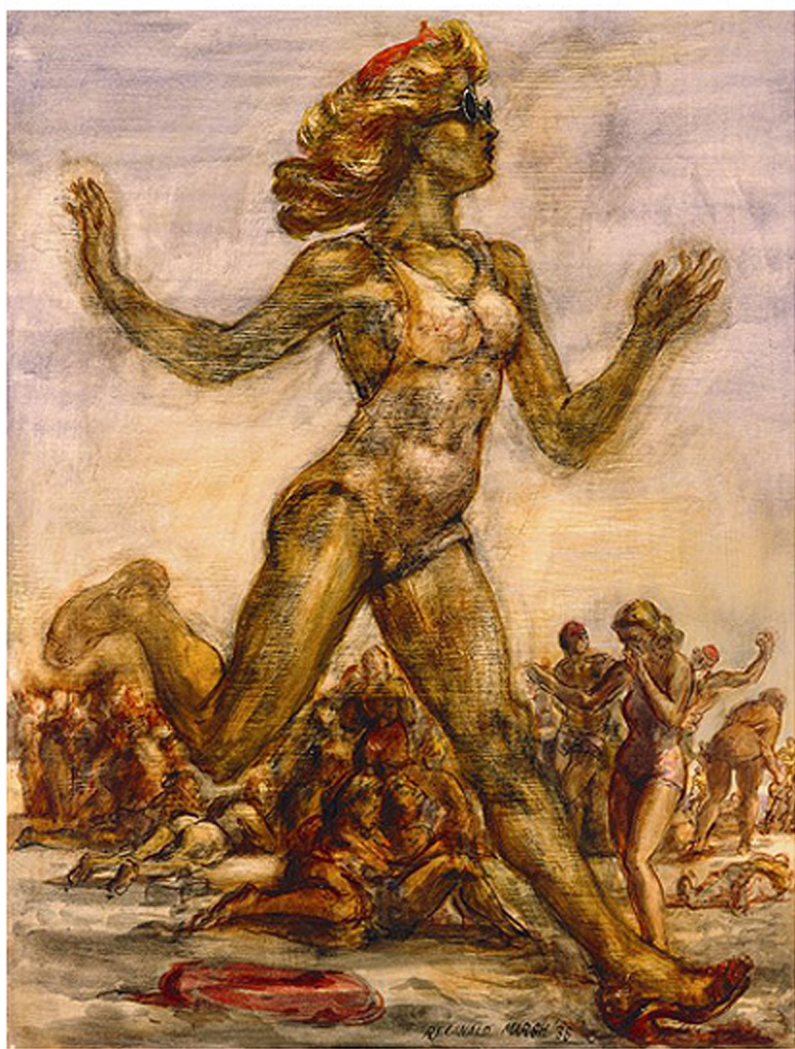
Girl Running on Beach (1938)

Marsh is also happy to observe that nothing has made any alteration in the design of the girls of 14th Street. Marsh's intense, detailed interest in this design is registered in scores of paintings and hundreds of drawings. The girls apparently are numberless. Marsh is not yet 50. So this remarkable output may be only a beginning.