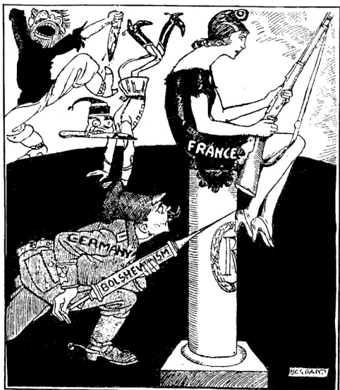
THE POISONED NEEDLE.

GERMAN FRITZ—"While France is so intent on execution of the Peace Treaty, I'll inject this serum supplied by the firm of Lenine, Frotzky & Co."