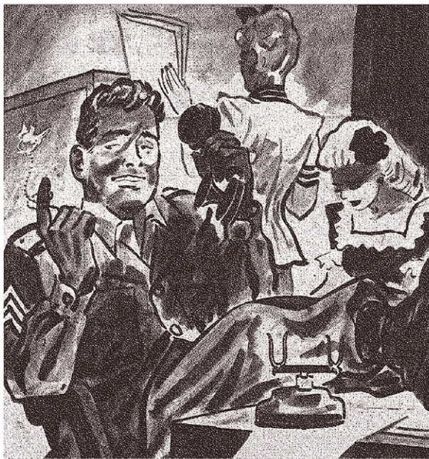
One lone operator set himself up in a swank office.

basis in their own stolen trucks. This cut down his administrative headaches.