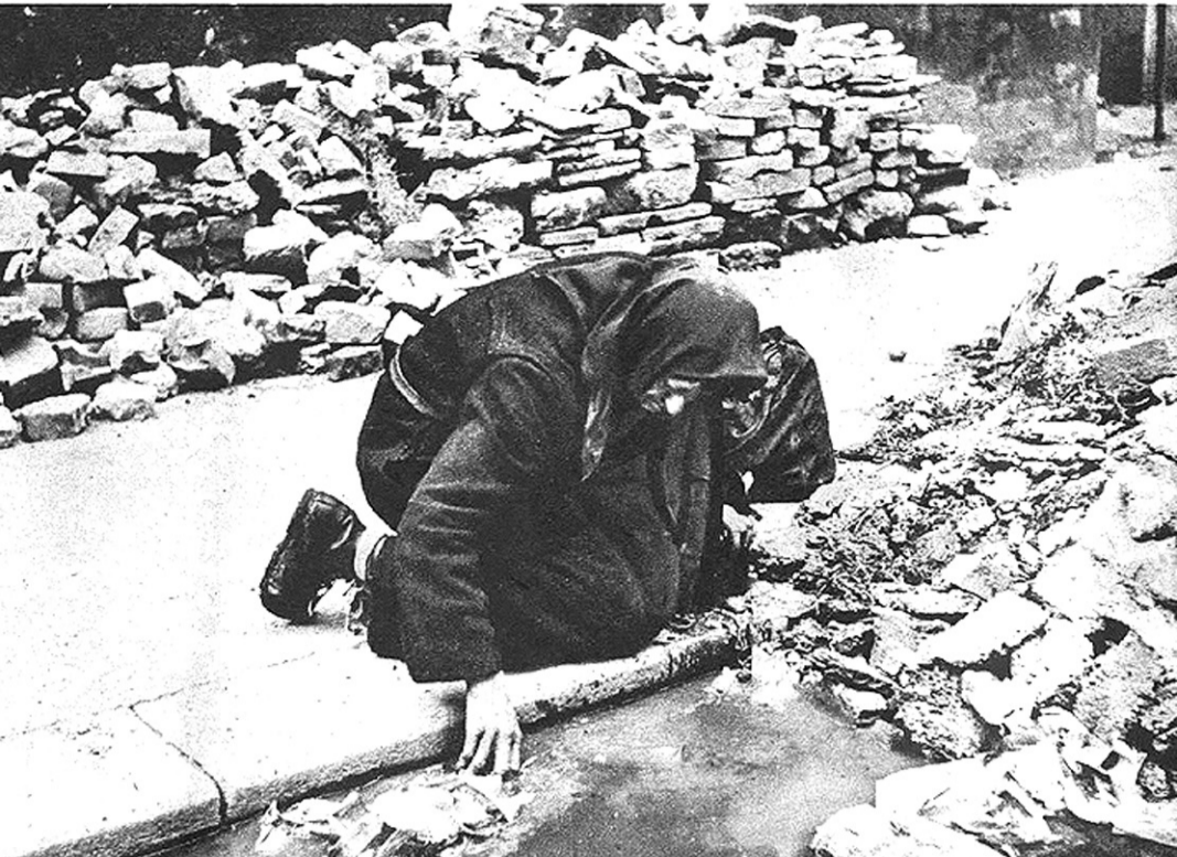
Vienna was poor before the war, but now it is far poorer. Women must hunt for usable junk in the gutters.

too, when we entered Vienna. Many of the Russians in town had just been paid off after five years of missing pay days, so their wads of money were so much lettuce to them.