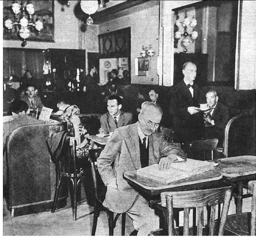
This is one of the surviving cafes, once the centers of Viennese culture.

always sold out, proprietors will always make room for one of their favorite soldiers.