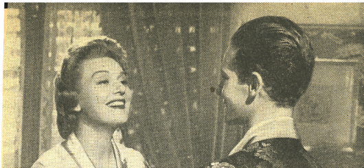
FRENCH FILM GAME OF LOVE TAKES LIGHT VIEW OF ADOLESCENT SEX

justment? Dr. Popenoe has listed as one of the first requirements the exclusion of any attitude that sex is a bad thing.