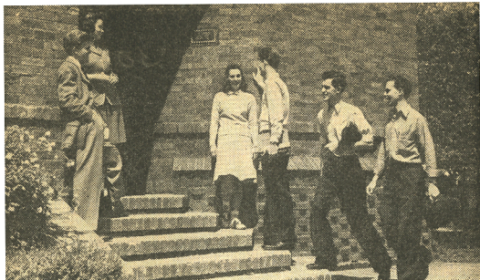
U.S. CO-EDUCATION RESULTS IN NATURAL SOCIAL RELATIONS

ous thing which decreases the importance of the husband. Instead, it is a healthy development which increases the happiness of both sexes.