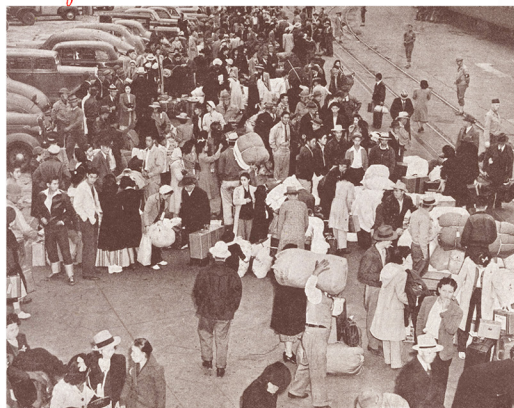
Exile begins, as the U. S. Army moves the Japanese out of Los Angeles as a military precaution