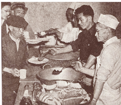
Mealtime for interned Japanese at Manzanar Government camp, in Owens Valley, California