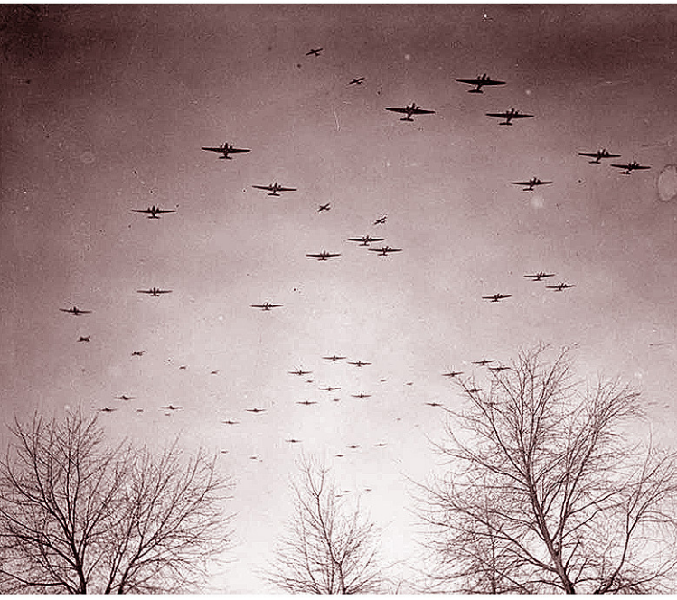
In the skies over Germany a small part of the 5,000 plane armada roars en route to Wesl, where 5,814,000 pounds of men and guns and equipment were dropped in an area two miles by three miles.

bling out of the C-47s, their green camouflage chutes blending with the dark gray ground. The troop-carrier serial seemed like a snail, leaving a green trail as it moved along. And it was crawling indeed—about 115 miles an hour. Our big Fort seemed to me to be close to stalling speed.