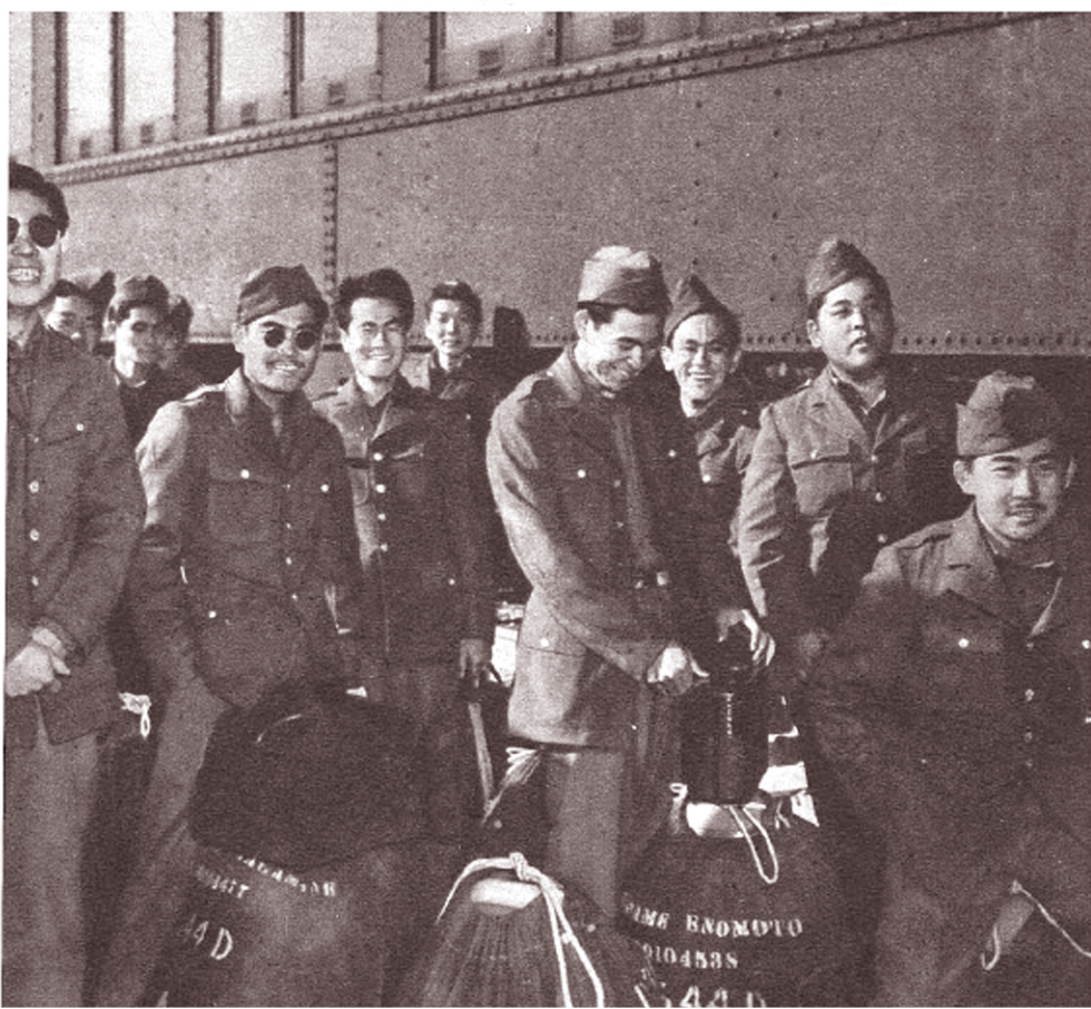
NEWLY ARRIVED VOLUNTEERS look forward eagerly to their U. S. Army training. Double-checked for loyalty, these products of American educational institutions are determined to get into the fight for their adopted country's freedom.

Democracy Outweighs Blood Ties For These Determined "Nisei"