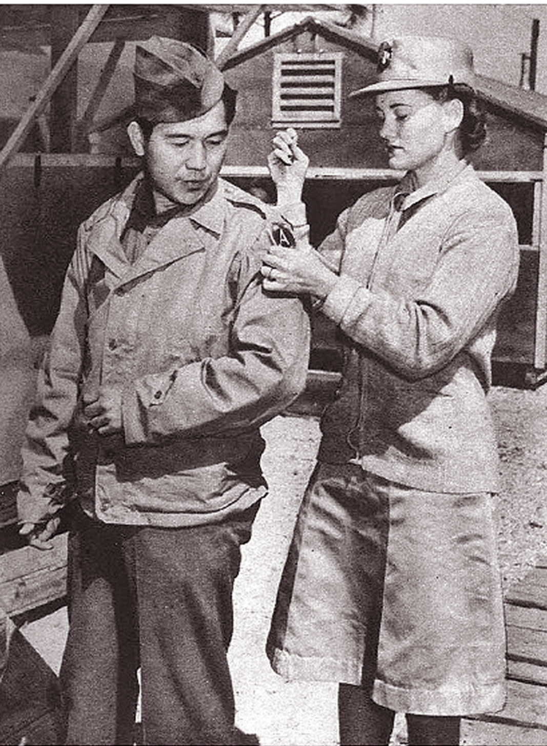
WAAC SEWS ON INSIGNIA for Japanese-American soldier at Camp Shelby. These soldiers are full members of our fighting forces and many of their officers have seen long Army service.