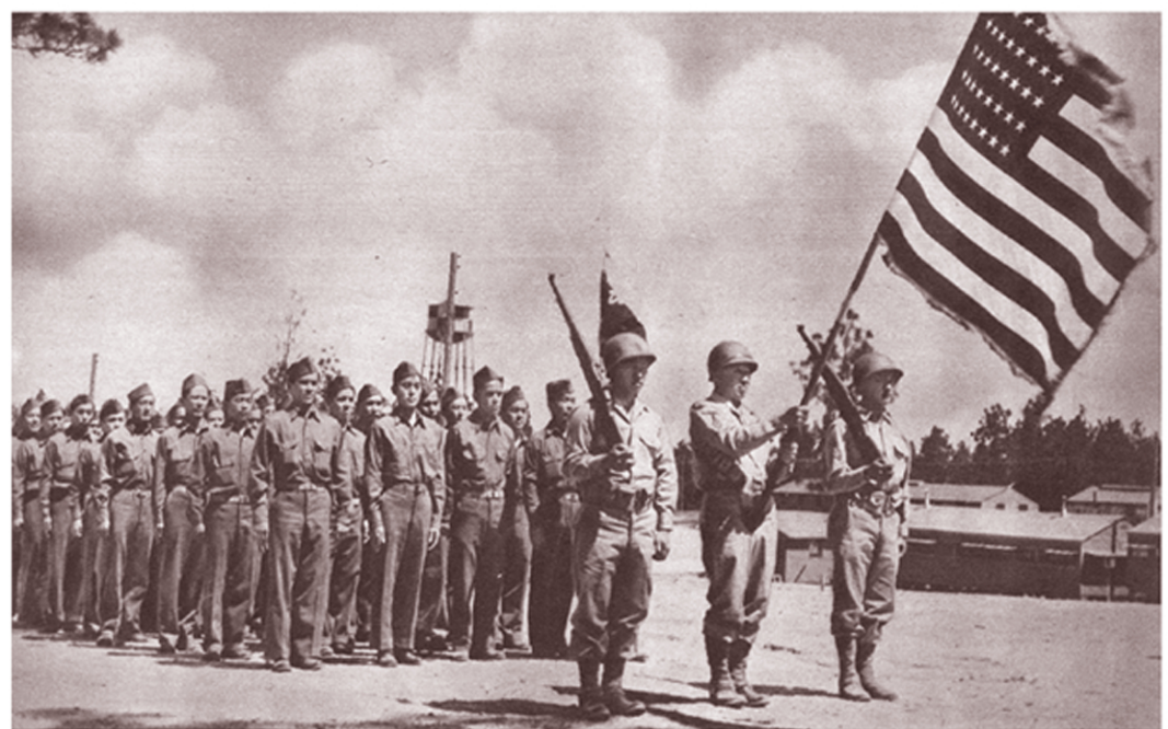
JAPANESE-AMERICAN SOLDIERS DRILL UNDER COLOR GUARD AT CAMP SHELBY, MISSISSIPPI. UNIT OFFICERS AND MEN ARE ALL CHILDREN OF JAPANESE IMMIGRANTS