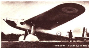
TUESDAY: FLEW 5,241 MILE