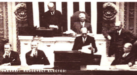
WEDNESDAY: ROOSEVELT ELECTED!