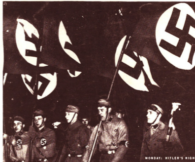
MONDAY: HITLER'S HIGH