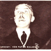
THURSDAY: VON PAPPEN BALANCES