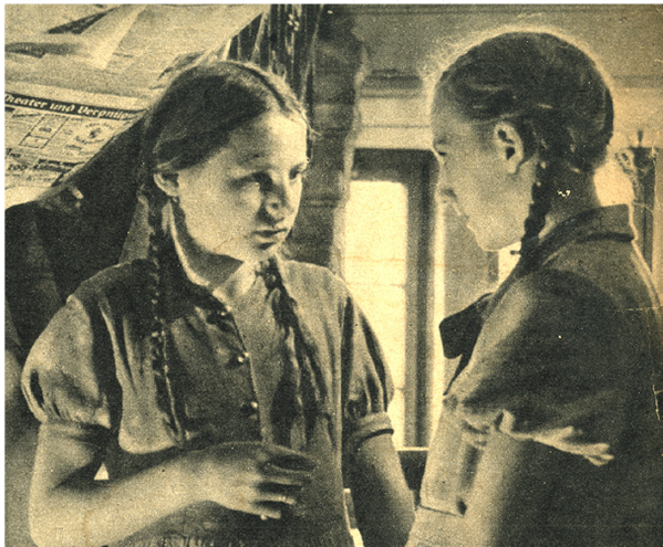
GERMAN GIRLS between ten and fourteen belong to the Jungmadel ; later, until they are twenty-one, they learn in the