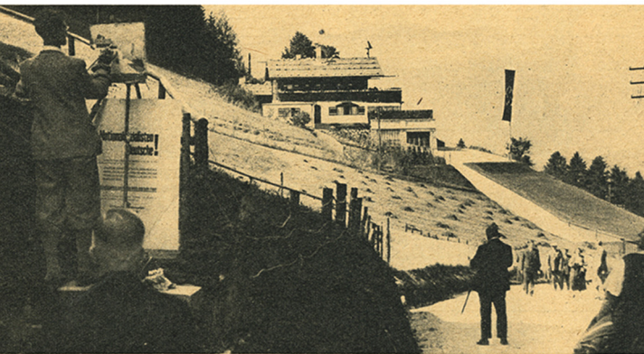
HITLER'S MOUNTAIN HOME IN BAVARIA HOLDS MANY PRICELESS PAINTINGS.

connoisseurs of all times, is revealed in his childishly amateurish water-colors. After his ascension to power, Hitler did not withdraw these paintings from the market. On the contrary, they are being sold now at prices which formerly were paid by internationally famous collectors for the works of Rubens or Franz Hals.