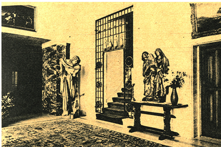
GOERING'S VESTIBULE REFLECTS HIS ABILITY AS A PLUNDERER.