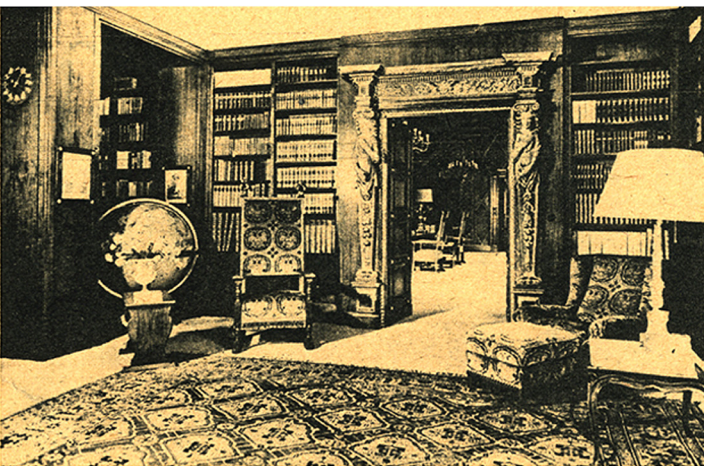
THE GOERING LIBRARY CONTAINS MORE CONFISCATED TREASURES.

One of the most remarkable cases of Nazi looting concerns a famous art collection which before the invasion belonged to Goudstikker, internationally known art-dealer. Goudstikker escaped from Amsterdam and got aboard a