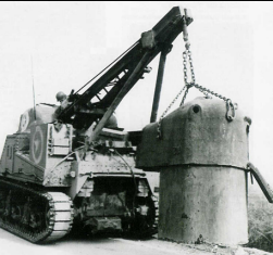
U. S. tank hauls away a pillbox which had been dug out of its position along the Gustav line near Cassino.