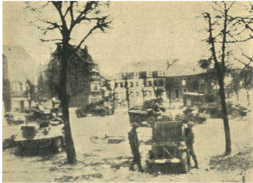
Reunion in Bastogne: Vehicles of the rescuing American Fourth Armored Division mingle with those of the Tenth after the Nazi siege is lifted