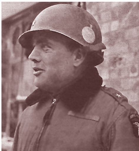
General McAuliffe: Nuts from the U.S.A.

Three days before Christmas, on the third morning of the siege, the shelling stopped; an unnatural silence fell on battered, surrounded Bastogne in Eastern Belgium. Up the road from the south, bearing a white sheet as a token of truce, came a Nazi major and a captain. They carried an ultimatum from the German commander to the Americans in the town. By sticking to their guns in the face of tremendous odds, the Yanks were holding up the development of the southern part of Marshal Karl von Rundstedt's great break-through offensive.