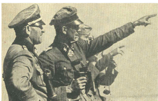
The panzers of General Dietrich (far left)

But the Americans paid heavily for their victory. The casualties ran to nearly 10 per cent, and they lost much equipment. Nevertheless, the Screaming Eagle Division was all for pursuing the Germans. Justly proud of the magnificent showing of his soldiers, a colonel said: “These men of ours sure are going to be insufferable from now on!”