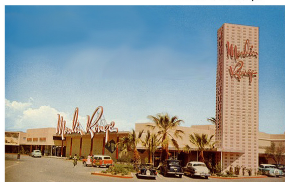
The entrance to the inter-racial resort indicates its plushy atmosphere.