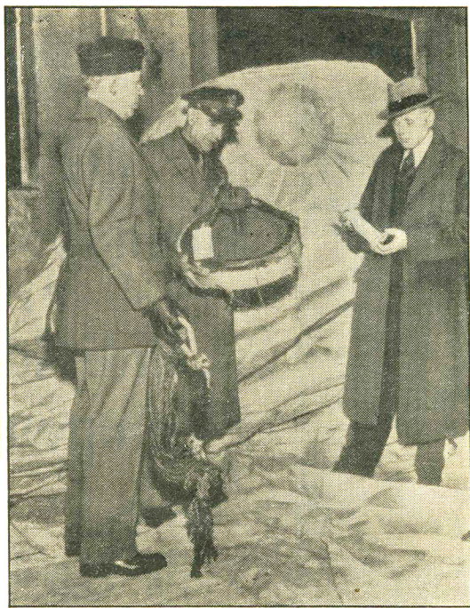
Montana has an unexpected visit from a Japanese balloon

Kalispell, Mont., hugged the secret to its bosom for nine whole days. Then, on Dec. 18, a Federal Bureau of Investigation announcement gave the news to the rest of the country: In a snow-covered, heavily forested area southwest of the Montana town, two woodchoppers had found a balloon with Japanese markings on it. Made of processed paper, the 33½-foot bag bore on its side a small incendiary bomb, apparently designed to explode and prevent seizure of the balloon intact. Also attached were 45-foot rope cables, roughly hacked as if to show that the balloon's gondola had been purposely severed.