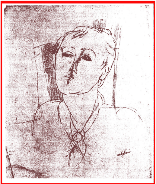
Portrait of a young man. c. 1916

After these explorations in the world of form, line in his drawing was no longer a boundary for colors or planes, but became a language in which newly discovered forms were described. Modigliani's line did not develop calligraphically as did that of Picasso and Matisse. Instead, it developed the strength of steel and the functionality of girders, defining and supporting the masses of his forms. In this, which gives force and character to Modigliani's delicacy and refinement, lies a magic which has proved irresistible to collectors and art lovers of our time. •