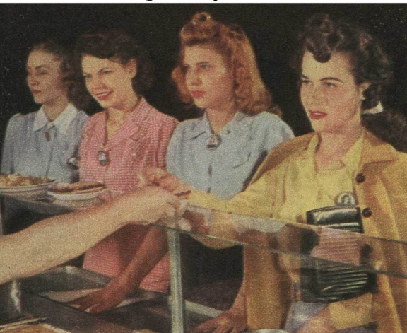
Her lunch at the company cafeteria usually includes a ham sandwich, potato salad, apple pie & coffee