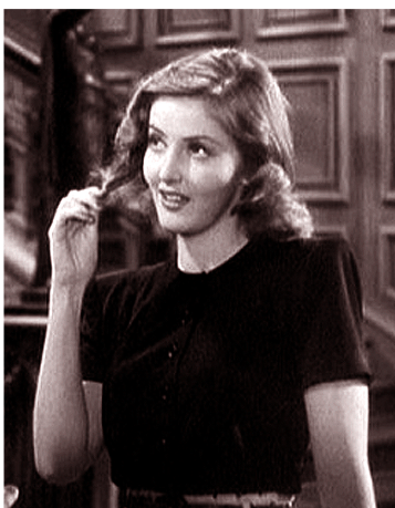
~as "Carmen Sternwood" in The Big Sleep

Miss Vickers was born in Ann Arbor, Mich., on May 28, 1925. Her father worked for the Ford Motor Co. and, consequently, Martha spent her early years in Chicago, Miami, St. Petersburg, Detroit and Dallas before going west with her family in 1940.