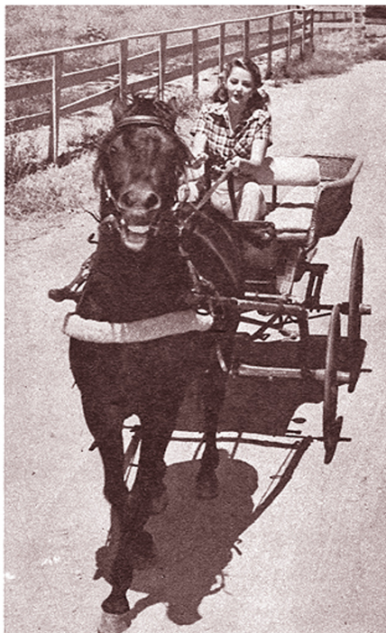
MISS VICKERS drives the hackney show pony while visiting on Harry Warner's ranch estate.

Miss Vickers has completed one picture since "The Big Sleep" and is currently working in a third, so there is a possibility that she will have completed three films before the public gets a glimpse of her on the screen. Her second picture is called "The Time, the Place and the Girl" in which she has the leading feminine role opposite Dennis Morgan and Jack Carson. She is currently working in the picture called "The Man I Love" in which she will have featured billing along with such other important players as Ida Lupino, Robert Alda and Andrea King.