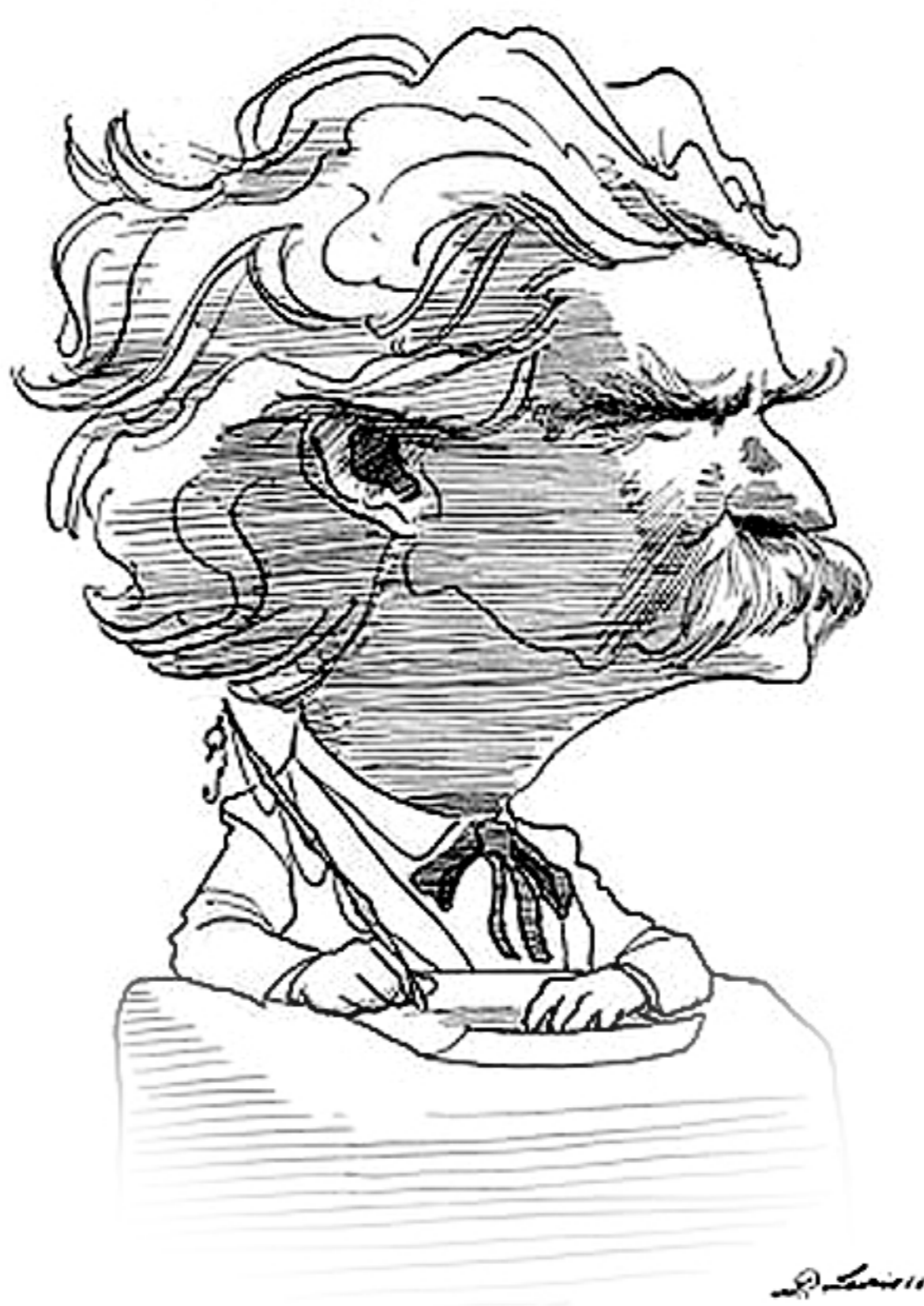
(David Levine Caricature Added)

In contradistinction to other authors, Mark Twain never hunted for material. He met his characters, lived with them, thought their thoughts, and then, because he could not help it, put them on paper.