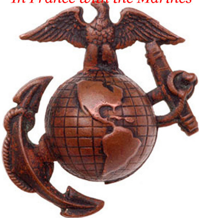
- the 1905 Eagle, Globe and Anchor cap device worn on their helmets