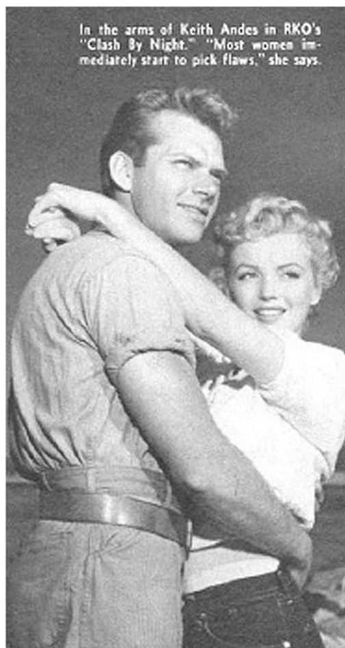
In the arms of Keith Andes in RKO's "Clash By Night." "Most women immediately start to pick flaws," she says.