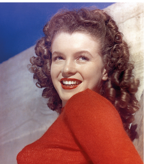
MARILYN'S FIRST PHOTO