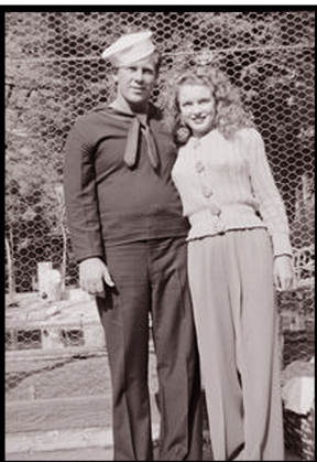
The Future "Marilyn" as Mrs. Joe Dougherty