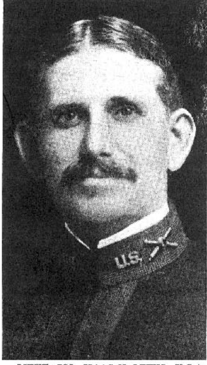
LIEUT.-COL. ISAAC N. LEWIS, U.S.A.,

"According to Colonel Lewis an aeroplane costing not more than $5,000 will easily be able to carry the gun, 2,000 rounds of ammunition, the gun operator, and the pilot. At a height of one mile or greater, and while moving at a speed of fifty miles per hour, it will be possible with this gun to pour in the most destructive fire upon the deck and fire-control masts of our battle-ships, and upon unprotected personnel of our land defenses, without endangering the aeroplane or its crew—it being practically impossible to attack successfully the rapidly moving aeroplane from below. The gun also opens a new field of attack and defense in that it will be used as an offensive weapon against other aeroplanes similarly armed. It means that hereafter unarmed aeroplanes will no longer be used in war, even for scouting purposes."