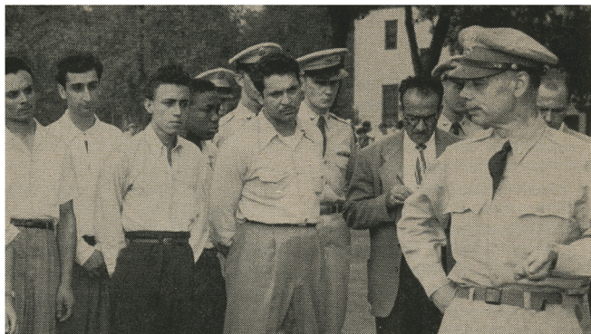
INDUCTEES ARE REVIEWED BY GEN. WALTER BEDELL SMITH

inch over the maximum admissible figure. It was a blow to Schayes; like most young Americans he was prepared to answer his country's call.