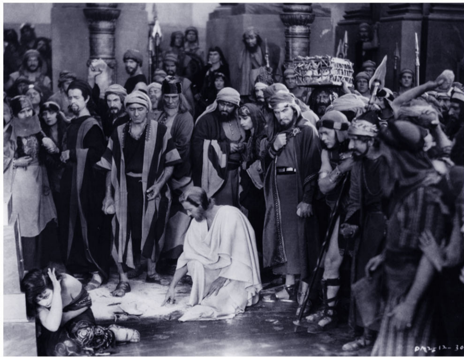
THE WOMAN TAKEN IN ADULTERY