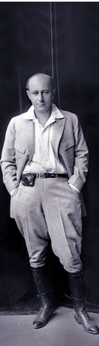
Cecil B. De Mille

ample, is shrewdly handled. You see Him , not directly, but through the eyes of a blind child who is being cured—first, blackness, then a gradually growing field of light and slowly, inexorably, the emergence of the enhaloed head.