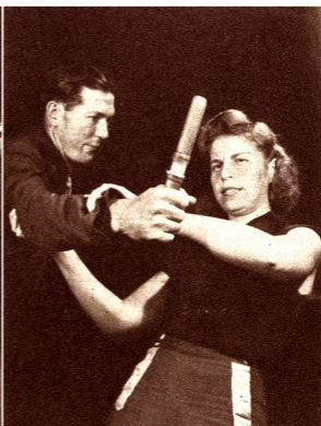
Her right hand grips his right upper arm from underneath. Locks her right foot against her attacker's right foot