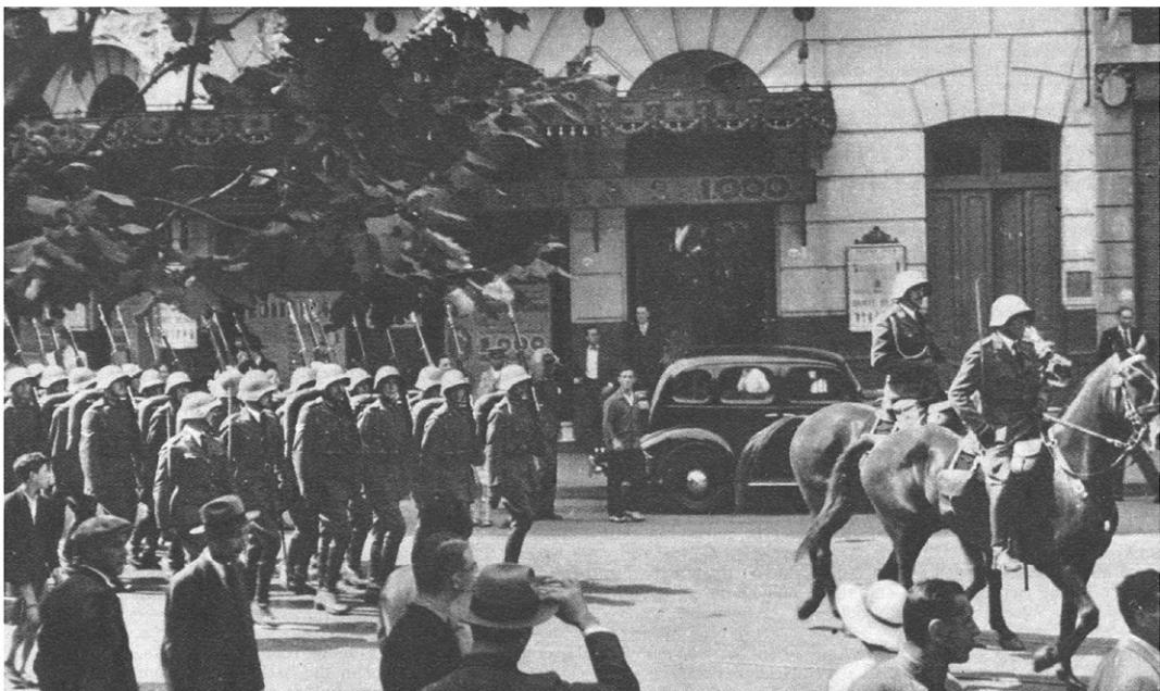
Chief pride of Argentina's strong-arm governors is their Nazilike army, here shown on parade. Note similarity of helmets and uniforms to German equipment

Just back from South America, Collier's correspondent reports on totalitarian government in Argentina, its link to Hitlerism, and what to do to guard our future security