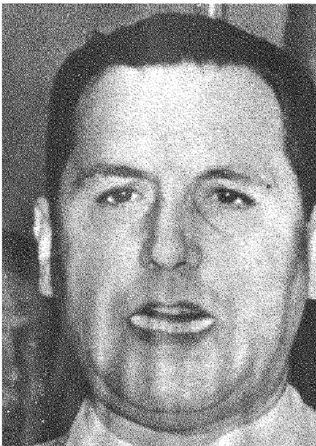
Juan Peron is the real boss who molds the state to a Nazi design

without fear of opposition, but with the tacit blessing of the Casa Rosada.