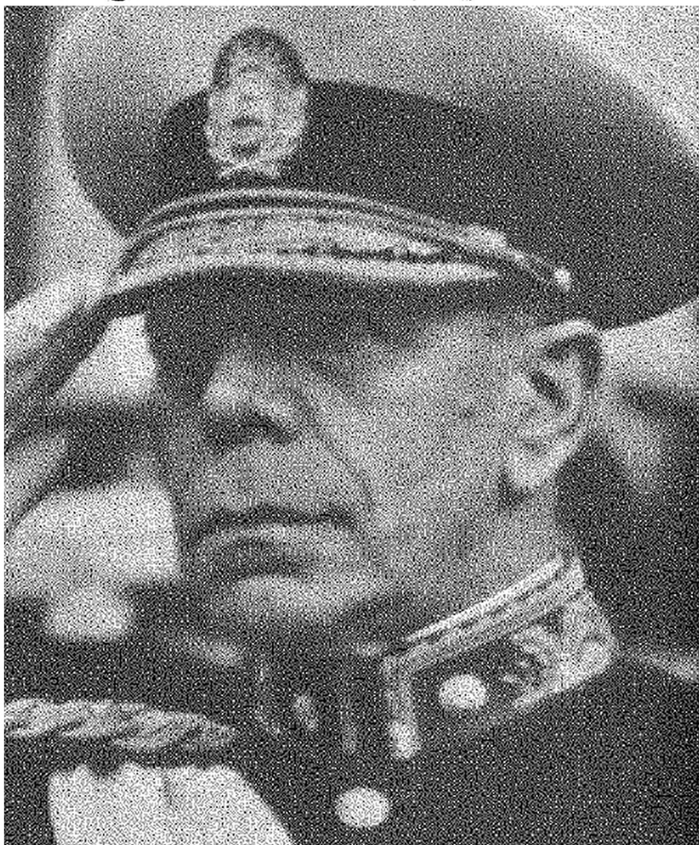
Gen. Edelmiro Farrell is president of Argentina, but takes orders from Peron

The national congress, provincial legislatures and city councils have been abolished. Governors and mayors are appointed by the national cabinet. All political parties or groups, all civic welfare organizations, male or female, have been taken over or disbanded by order of the state. The press, the radio, all agencies of information and opinion have been completely throttled. Nothing may or can be published that does not accord with the expressed wish and will of the government. The great La Prensa, La Nación and other metropolitan dailies, for fifty years the freest and most independent newspapers in the world, may not print a sentence that criticizes the persons or parties in power, or that praises the ideas and successes of the United Nations. Yet such pro-Axis sheets as the Federalist (formerly the notorious Pampero), the Cabildo and numerous others may denounce the United States and England and praise the Germans and the Japs, not only without fear of opposition, but with the tacit blessing of the Casa Rosada.