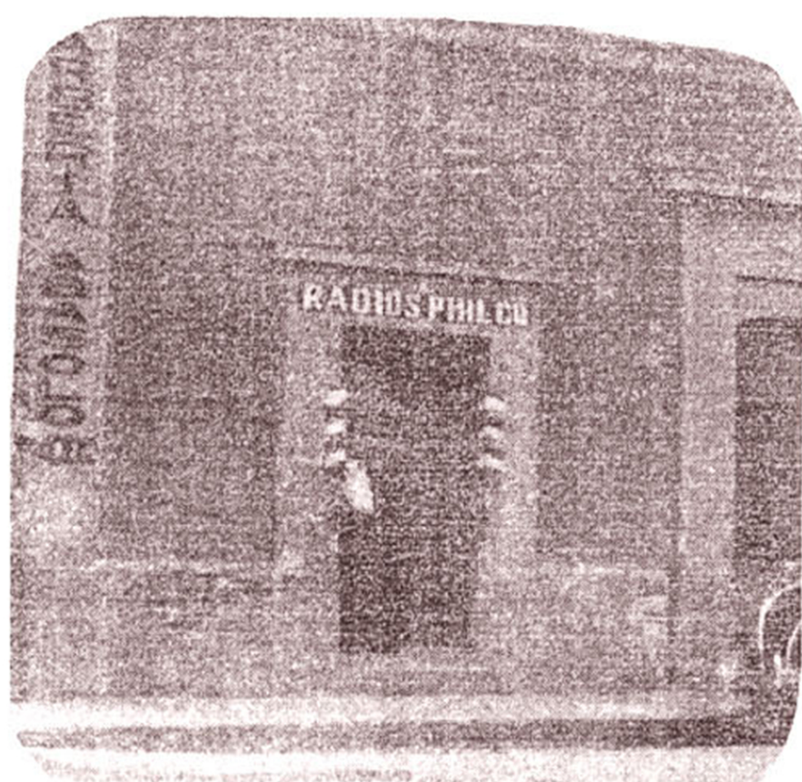
Shop of a Japanese "barber" in Hermosillo