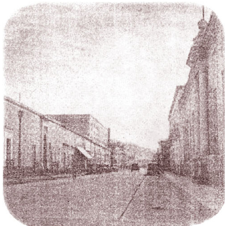
Agents also operate out of Hermosillo