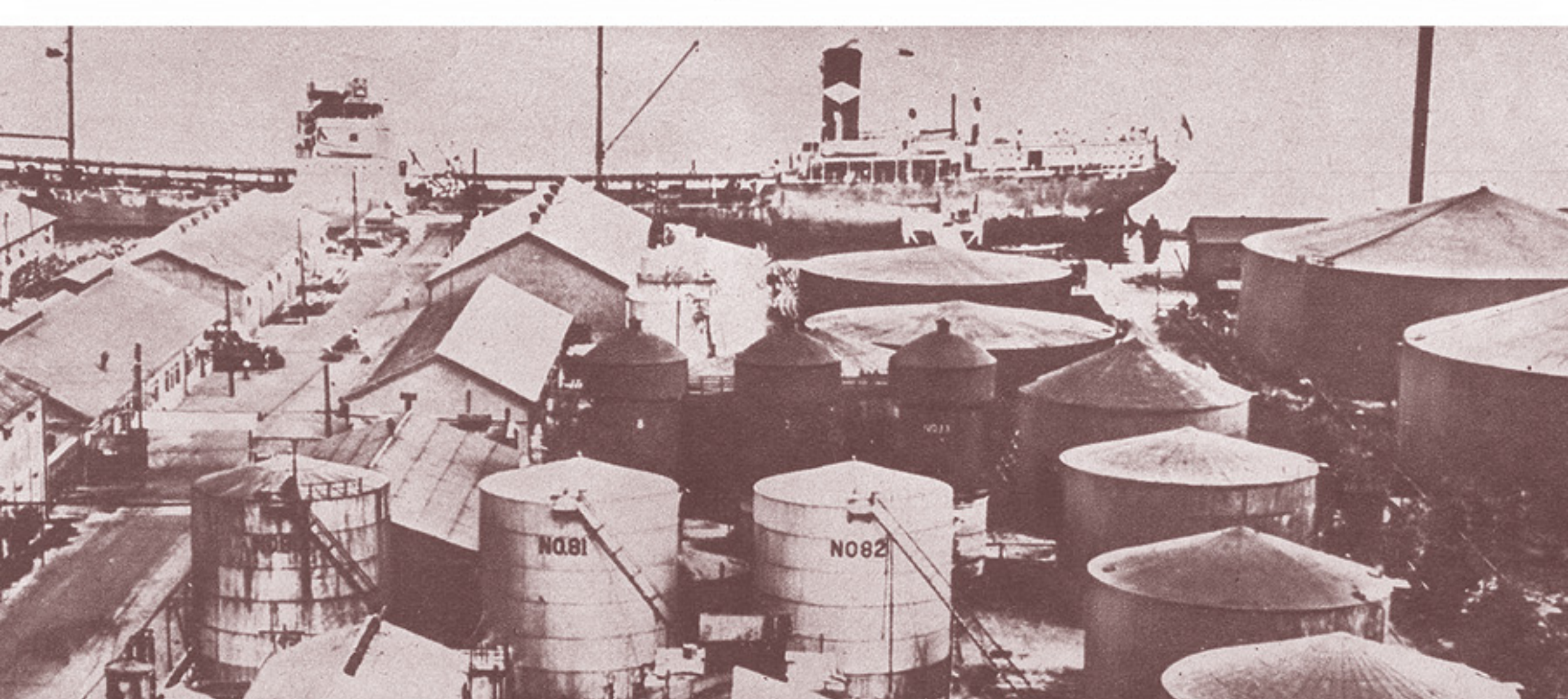
AN OIL REFINERY NEAR TOKYO. JAPAN HAS PLENTY OF OIL—SOME OF IT IS EVEN FLOATED UP FROM THE EAST INDIES IN CASKS BORNE BY THE JAPAN CURRENT.

In other words, she has an actual surplus of labor, and this labor is hewing out teakwood barrels, which then are filled with crude oil and then tossed ( Continued on Page 40 )