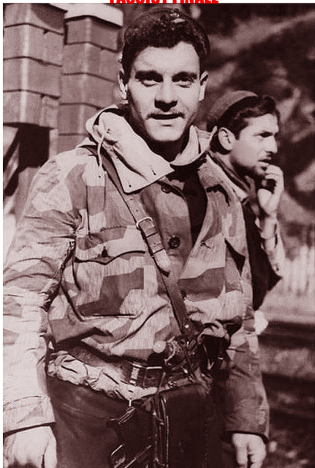
A typical Italian Partisan soldier. Note that the clothing he is wearing has been captured from Germans