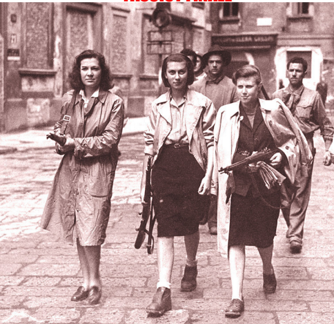
Italian Partisan fighters

vember 15th he did, with 8,000 soldiers.