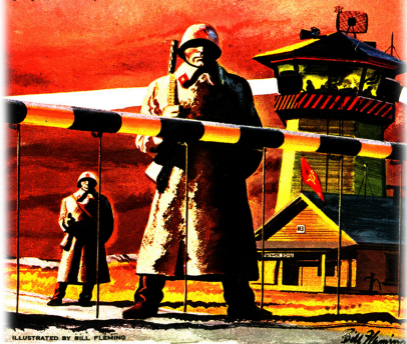
ILLUSTRATED BY BILL FLEMING

masters. But through the chinks in the seemingly impervious wall comes another story, telling of resistance and sabotage, of a suppressed people who have learned to fight fire with fire. These stories do not herald the imminent collapse of the Red tyranny, but they prove that the will for freedom surges strong behind that Curtain.