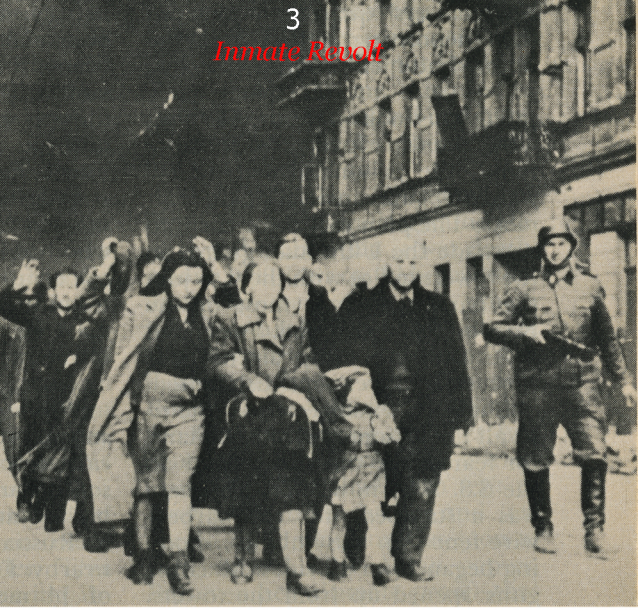
Nazi guards lead survivors of Warsaw ghetto uprising off to the death pens. Many Jews sensed where they were going and fought the Germans with fists and sticks.

tween ingenious double walls in their underground prison bunker. To make sure they were digging in the right direction, they used a compass stolen from the camp commander's quarters. They lighted the first dozen meters with Sabbath candles discovered among belongings of dead women who had brought them from the ghettos. Using a saw made from a kitchen knife to cut the leg irons used to hobble them, they completed their flight to freedom. Thirteen survived machine-gun fire to fight in nearby forests as partisans.