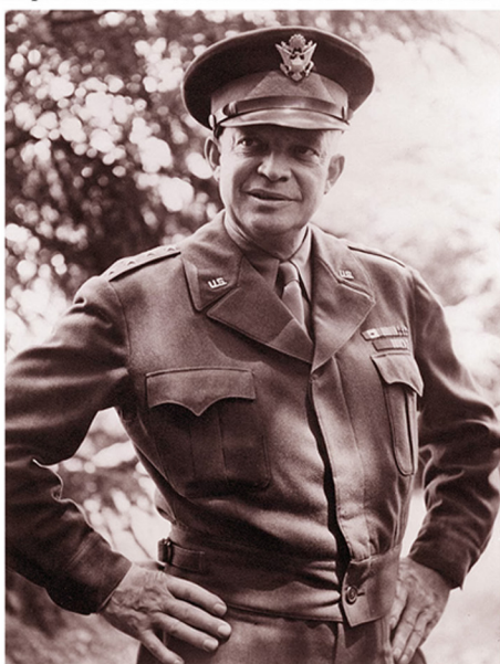
General Ike Eisenhower is responsible for putting our fighting men in Europe in battle jackets, has been wearing this model since the early part of this year. The general's jacket is buttoned at the bottom, his own idea. The one the boys will get is like this except it has an extension tab at the waistline

Each war seems to produce one article of wearing apparel which finds a permanent place in the wardrobe. In the first World War, it was the trench type of raincoat. Now comes the battle jacket. When the Quartermaster General's office announced last spring that our boys would be issued a new battle jacket for the European Theater of Operations and manufacturers took one look at it, they whooped with joy. Already it promises to become a civilian avalanche.