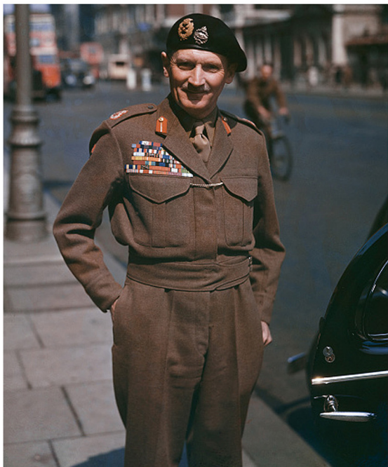
Marshal Sir Bernard Law Montgomery, best known in the clothing world for his famous beret, wears a British battle jacket. The British version is slightly shorter at the waist than ours because the uniform is worn with high trousers and suspenders. The trousers of our troops are designed to be worn with a belt

A similar jacket had been worn for some time by the R.A.F. When our 8th Air Force boys arrived in England, they liked the jacket the English pilots were wearing and promptly went to English tailors and had themselves jacketed. It wasn't regulation. But who was to argue with the golden boys if they wanted to shoot down enemy planes wearing a well-tailored jacket—or star-spangled tights for that matter?