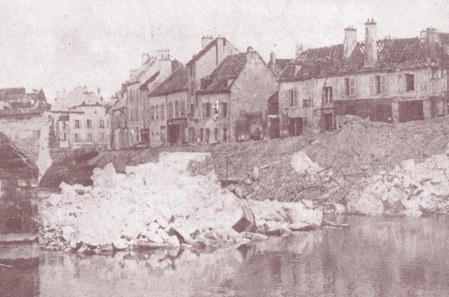
The ruins of the bridge across the Marne at Château-Thierry where the Seventh Machine Gun Battalion, Third Division, helped check the German advance

W HEN, in the early summer of 1918, the Second and Third Divisions of the United States Army scrambled across France and jumped breathless into the fighting near Château-Thierry, there sprang into the minds of the folks at home the notion that "with the help of God and a few Marines," the A. E. F. had then and there halted once and for all the German drive on Paris—that just as the forces of the Imperial German Army, at the height of its power, were advancing on the French capital, they were met on the Paris-Metz road by a handful of Thermopylae-minded young Americans who, with devastating effect, proclaimed "They shall not pass" and so barred the road to civilization. Now this was a delusion, one of the most extraordinary and, in its final effect, one of the most helpful delusions in history.