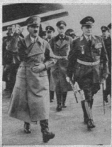
When this picture was taken, Adolf Hitler and Hermann Goering were on their way from the Munich audience to attend the cremorial state funeral of the Nazis killed when a bomb went off during the Nazi soldiers' celebration last year. Hitler, who barely escaped with his life then, died to Berlin returned two days later for the state

To Attend Their Last State Funeral Together