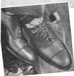
RUGGIED GRAINS —Bostonians' answer to winter walking. Heavy soles for men who won't jump puddles. Above, Tech.