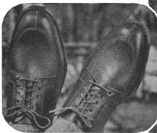
WHISTLE while you walk in Walk-Fitted Bostonians. Leathers give and take with foot action. Above, Stalwart in Scotch grain.