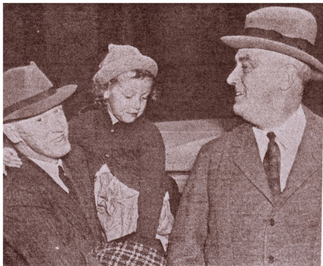
TOGETHER: IN THE EARLY NEW DEAL DAYS