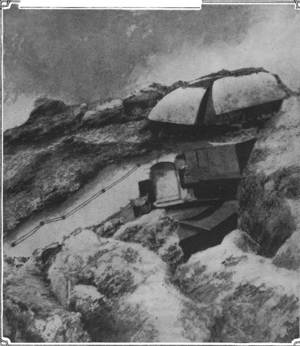
Photograph Shows Fort Loncin, One of the Fortresses Guarding Liege, After It was Struck by a Single Shell Fired from the 16.5-Inch Krupp Siege Gun of the German Artillery. The Fortification was Almost Entirely Subterranean and of Unusual Strength. Above is Illustrated the Method Used in Mounting This Huge Engine of Destruction